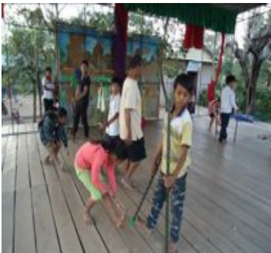
They are training the new dance

We continuously try to explain Khmer guides and other people in positions close to tourism the nature of our dancing projects and us helping the poor children. We also started using the Smile Restaurant and more intensively to promote the program and have thus attracted more visitors. We tell them about the whole MKK project and the background of the children. We also try to furthermore support the kids through our godparent program. Although great interest has been voiced, only four kids have active godparents. To ensure that this number increases in the future, we will advertise and develop this program further next year. In addition, tourist groups coming to the performance will be offered small souvenirs made by the different MKK classes from a mobile store next year.