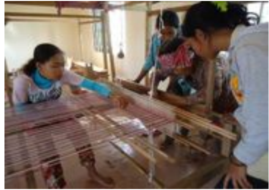
They are getting the explanation how to throw the shuttle and how to join the thread.

One dropped out due to physical incapability after thorough discussion with us, the teacher and her relative. Now we are looking for other new interested kid to instead the drop out.