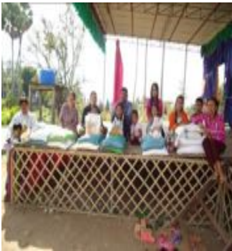
Children and their family gain the scholarship in the Apsara Centre.

This year, a total of 80 children received the scholarship in order to motivate and allow them to continue their studies, 39 of them are boys and 41 are girls. This year, three students dropped out because two girls moved away and one boy finished high school. He now studies management in Phnom Penh. We also found three additional students to make up the gap from those who dropped out in every quarter. The dropouts were replaced by new students immediately. The provision scholarships were distributed in a target area of 17 villages of Kampong Cham province.